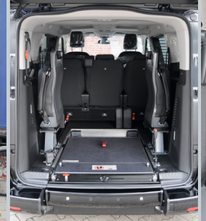
With the optional EASY FLEX ramp folded down the luggage compartment is fully usable.

Optional tip & fold seats allow flexible use of the vehicle.