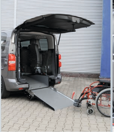
With the unfolded ramp the vehicle can be accessed comfortably with a wheelchair.

Peugeot Traveller L2 / L3 (wheelbase: 3,28 m - length: 4,96 m and 5,31 m)